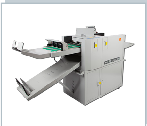
MAGNUM CUT/CREASE/PERF/FOLD SYSTEMS