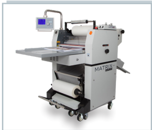
MATRIX LAMINATING SYSTEMS