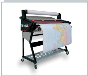
LINEA ENCAPSULATION SYSTEMS