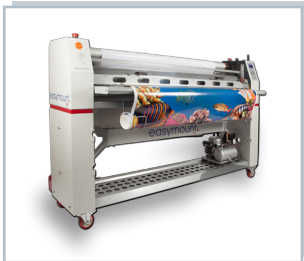
EASYMOUNT WIDE FORMAT SYSTEMS