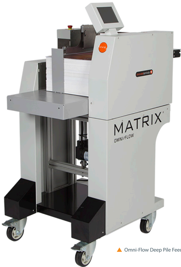
▲ Omni-Flow Deep Pile Feeder