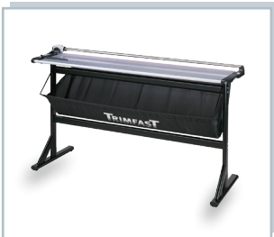
TRIMFAST TRIMMING & CUTTING SYSTEMS