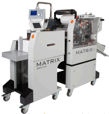
▲ MX-370P with Omni-Flow Deep Pile Feeder

Ideal for both the Digital and Commercial markets for short-to-medium run lamination and foiling of business cards, menus, book covers, greetings cards and bespoke prints.