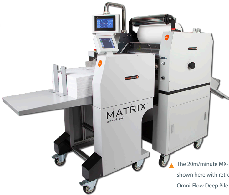
The 20m/minute MX-530PS shown here with retrofitable Omni-Flow Deep Pile Feeder