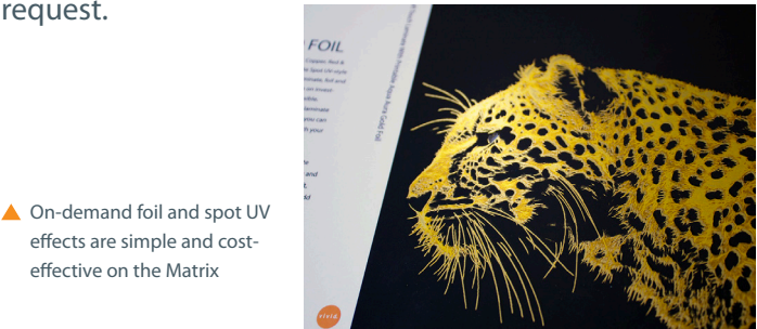
On-demand foil and spot UV effects are simple and cost-effective on the Matrix

With foils available in over 20 colours including White, Silver, Gold, Copper, Red & Blue and a Clear Gloss Film to create Spot UV-style finishes. Using just one system to laminate, foil and Spot UV offers a greater return on investment, as multiple applications are possible. More colours are available on request.