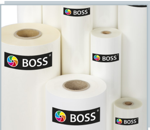
BOSS FILM / AQUA AURA FOIL SUPPLIES

Vivid design and manufacture a wide range of laminating systems, specialising in function, style and reliability.