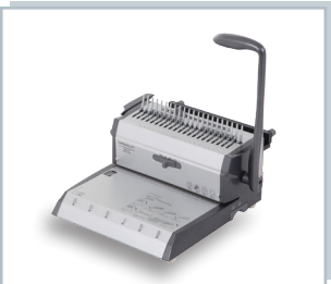
MAGNUM BINDING SYSTEMS